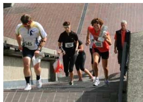
DrongO at the London City Race (by Ollie O'Brien)