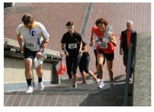
DrongO at the London City Race